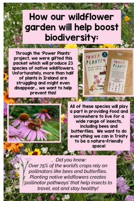
Extra information for parents.