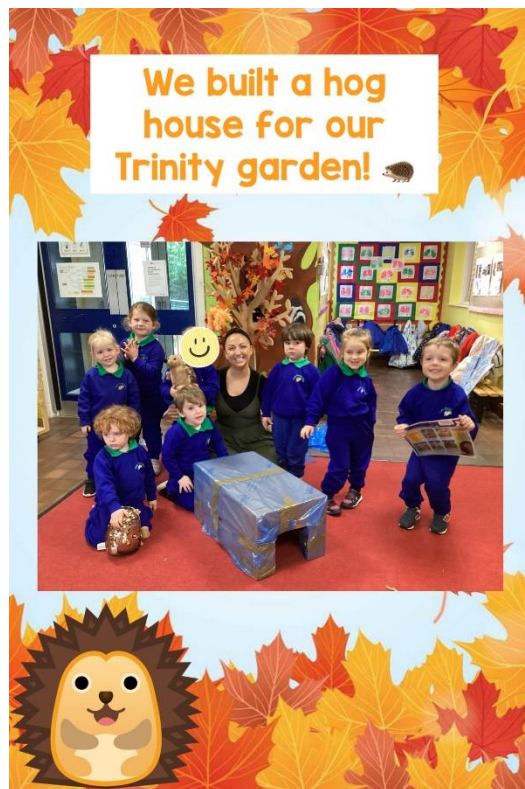
We built a hog house as part of RSPB's wild challenge.