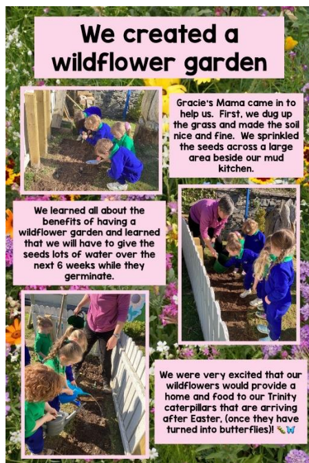
Our new wildflower garden.