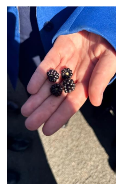
Forging for berries in school garden