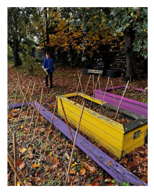
Cleaning up school garden