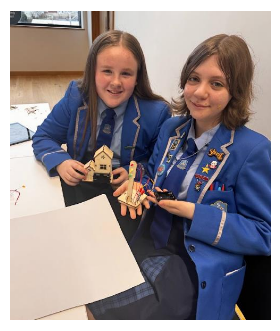
Students learning about renewable energy