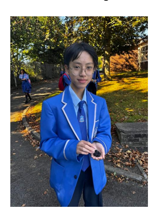
Year 8 Gardening club