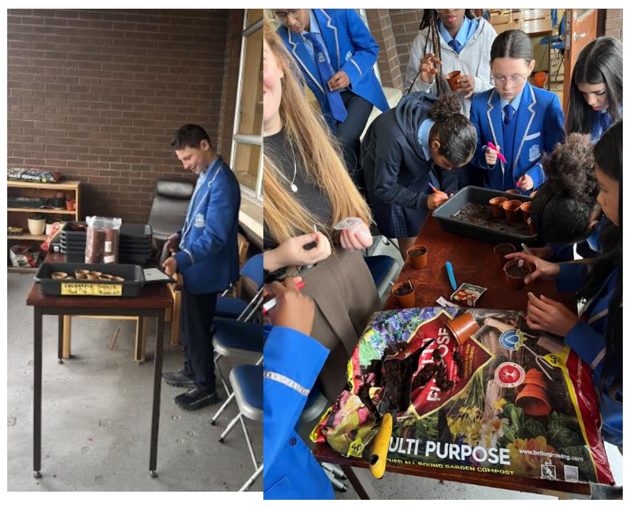
Planting new seeds