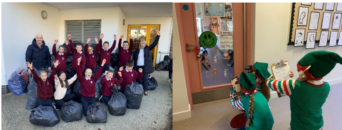
Latest Cash for Clobber collection raised £264 Eco Energy Elves/Detectives in action.