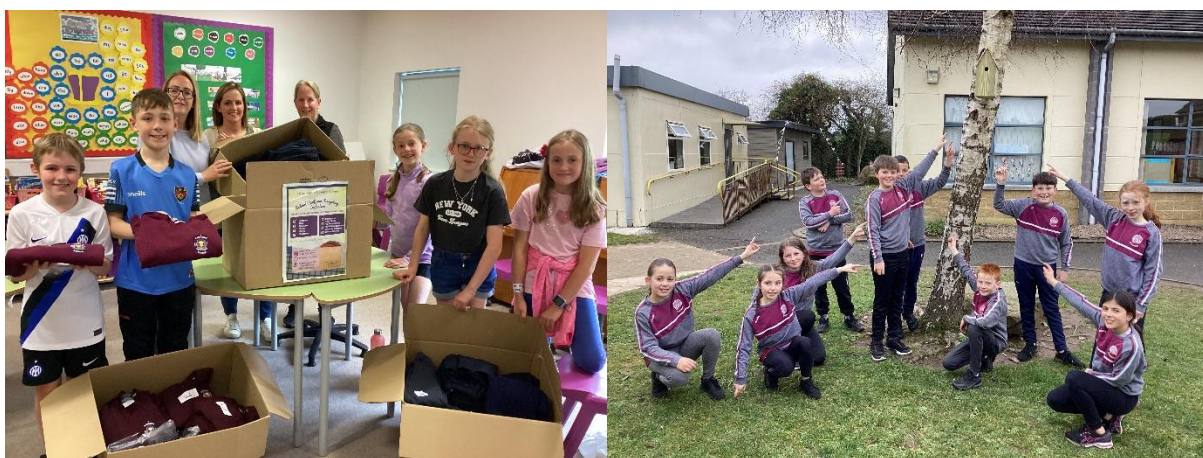
Uniform Recycling Teamsorting donated items of uniforms ahead of collection date. St. Colman's pupils share location of one of their bird boxes gifted by St. Bronagh's