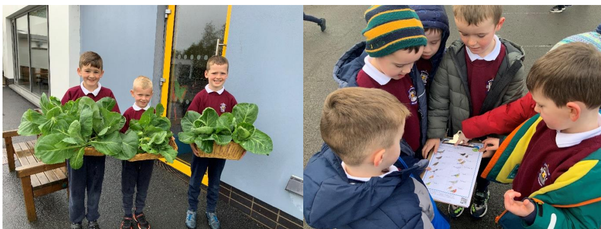
Cabbages grown in School Veg. Box. Pupils identifying species of birds spotted during rspb 'Big Schools' birdwatch.'