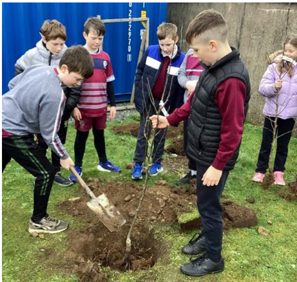
St Bronagh's and St Colman's together

Following the tour, we held a joint Eco Council meeting where pupils from both schools shared their ideas, discussed current initiatives, and explored ways to further enhance biodiversity. One key idea that emerged was the planting of native hedging and trees to encourage more wildlife and natural growth in school environments.