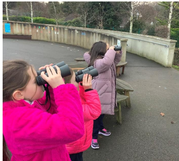
Big Schools Birdwatch 2025

Biodiversity actions play a big part of St. Bronagh's School life. As pupils move up into their new Classes they become responsible for a new bird station/feeders. St. Bronagh's pupils encourage birds to stop in our school grounds for tasty feasts at 'Bronagh's Bird Cafe' or 'Flier Tucks' or fly through for a quick bite at 'Mc Birdie's Fly