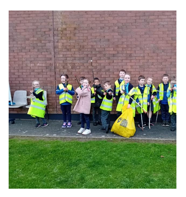
Adopt a Spot