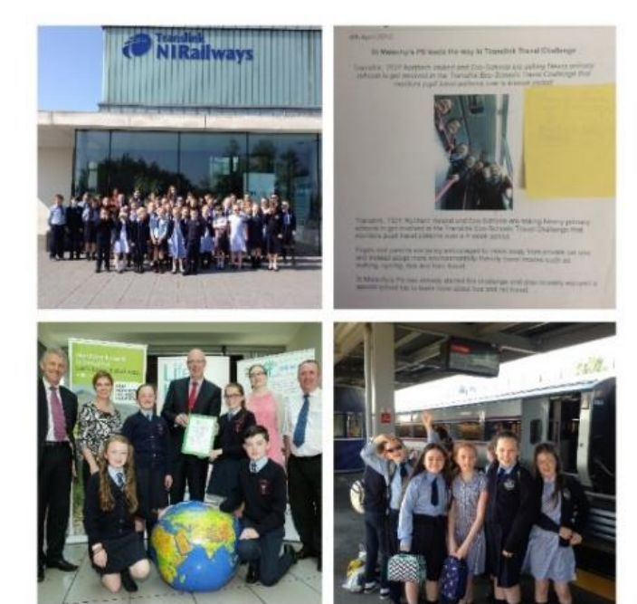
A collage of years of St Malachy's Travel Challenge