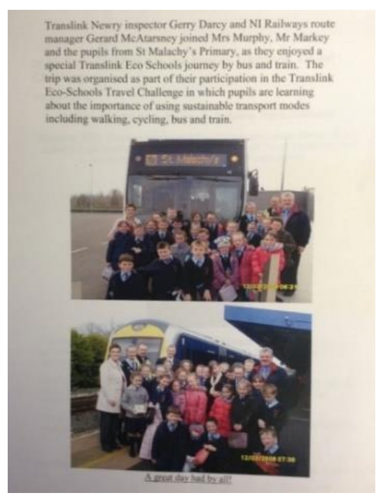
First Year Participation of St Malachy's Primary School