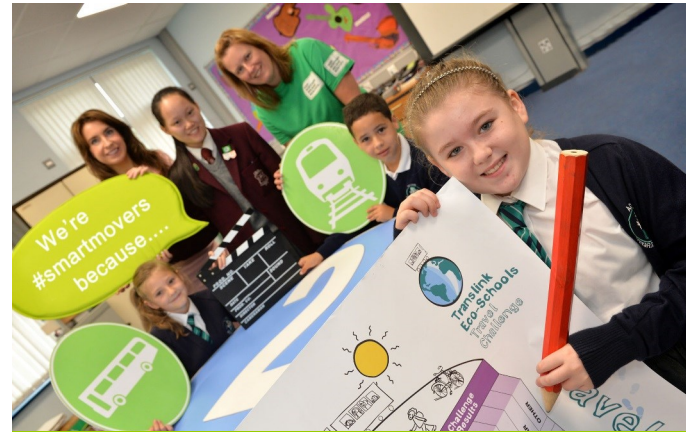
Pupils from Ulidia Integrated College and Acorn Integrated Primary take up the Translink Travel Challenge and tell us why they are #smartmovers.

Eco-Schools are delighted to be working with Translink on the Travel Challenge for the eighth year. We would love to see all schools taking part and thinking about green ways to get to school. Reduce congestion around your school gates, get parents thinking eco, and enjoy the health benefits of ditching the car, getting fresh air and exercise for short journeys.