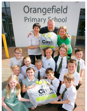
Orangefield Primary, Belfast, were delighted to bag a top prize in Cash for Clobber 2016.

Schools who would like to get involved are asked to call the Cash for Clobber Team on 028 9447 9380 or visit www.cashforclobber.com or www.eco-schoolsni.org .