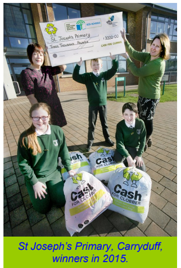
St Joseph's Primary, Carryduff, winners in 2015.

The school that collects the most clobber per pupil wins a magnificent cash prize. There are 3 bands to win prizes in, depending on the size of your school.