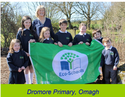
Dromore Primary, Omagh