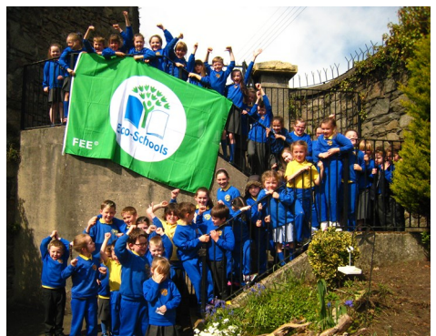
Bunscoil an Luir, Newry