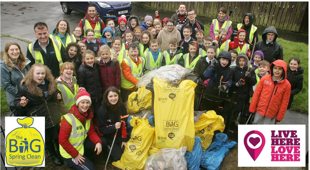
Pupils from Fairview Primary, Ballyclare Primary, Tir-na-Nog Primary and Ballyclare High clean-up.

Don't forget you can pledge your support to the Live Here Love Here campaign and receive updates about actions being taken in your community.