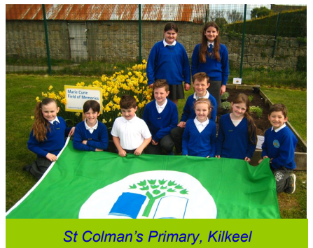
St Colman's Primary, Kilkeel