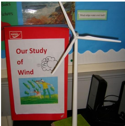
Above: energy topic work on display at school. KS 4/5 look at renewable energy as a class topic. .