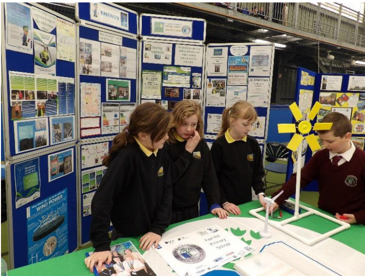
Above: Fair Hill's energy display stand at the Eco-Schools 20 th Anniversary Event.