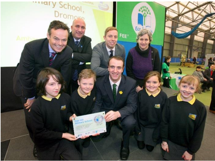
Above: Fair Hill receiving their Ambassador Eco-School award during the Eco-Schools 20 th Anniversary Event.