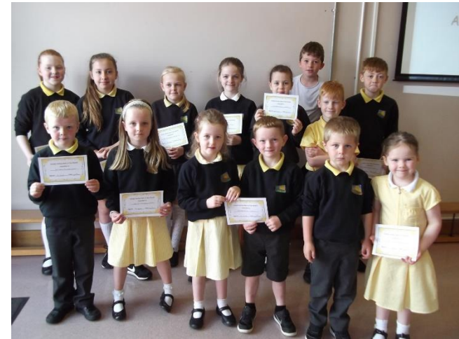
Above: Switch off Lights Awards presented in assembly.