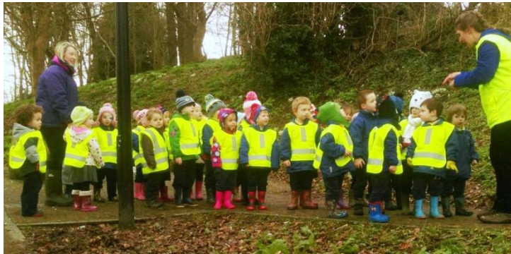
Above: Pupils go looking for snowdrops in the local park.