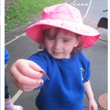
Above and right: Pupils learn all about the biodiversity topic.