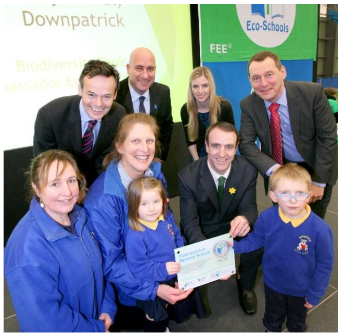
Above: Downpatrick Nursery School receiving their Ambassador Eco-School award during the Eco-Schools 20 th Anniversary Event.