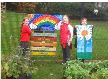
Six Mile Integrated PS - Spruce Up

Don't forget you can still pledge your support to the Live Here Love Here campaign and receive updates about actions being taken in your community.