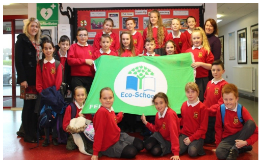
Carmoney Primary School celebrate Green Flag success.