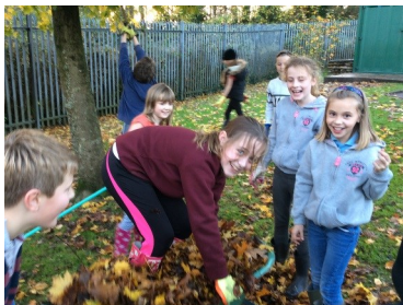
Andrews Memorial PS - Green Up

Over 100 pupils from St Colm's High School and St Mary's Primary School in Draperstown took part in a mammoth Clean-Up of their local area and collected 23 bags of litter!