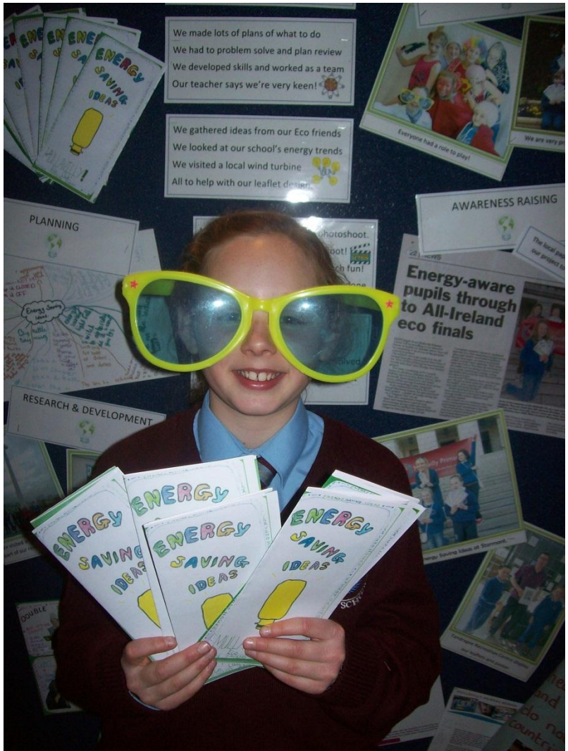
All Ireland Finals of ECO UNESCO Young Environmentalists