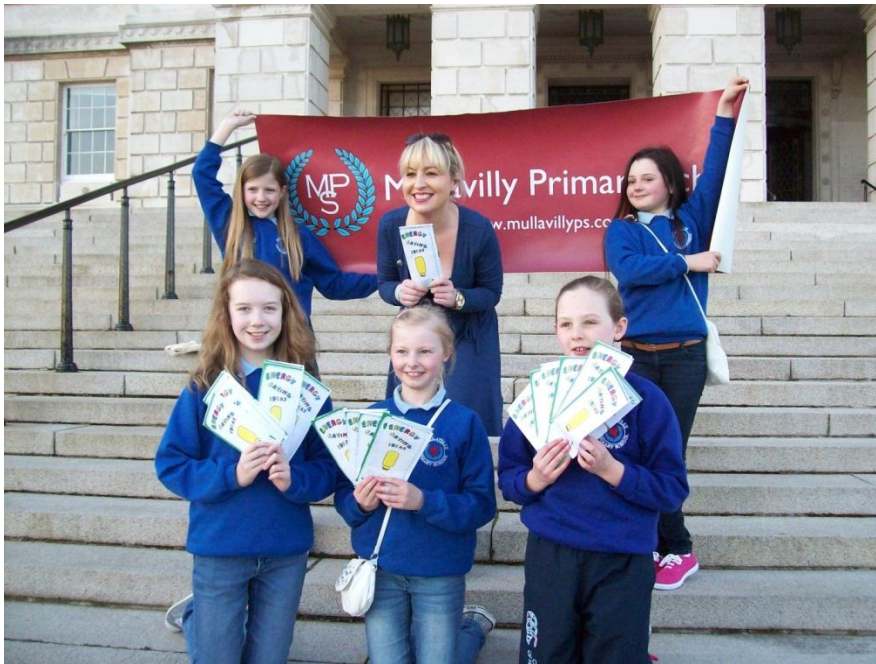
Launching our leaflet at Stormont

Pupils and teachers were able to use the games, activities and lesson plans at www.operation-energy.com to teach children about energy saving in a fun way. We have a link on our school website so that children and parents could access it easily from home.