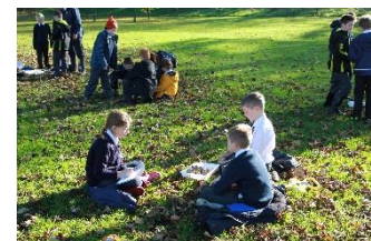
Fairview Primary School pupils participate in the Air Quality Survey in Ormeau Park Belfast